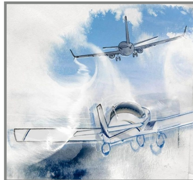
AOPA Pilot - May 2017

Greetings EAA Chapter Members and Friends,